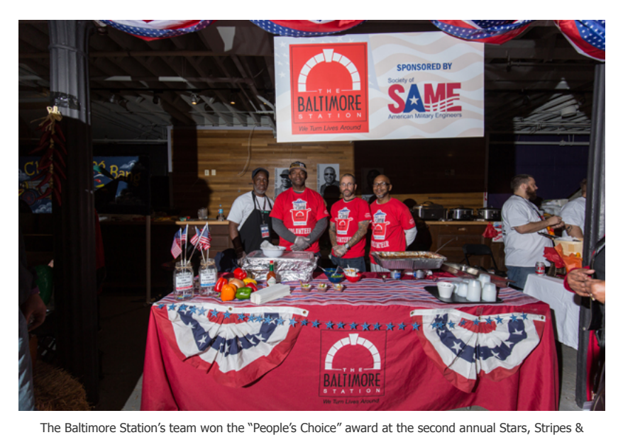
Chow event.

To submit photos for The Business Album, email swallace@thedailyrecord.com.