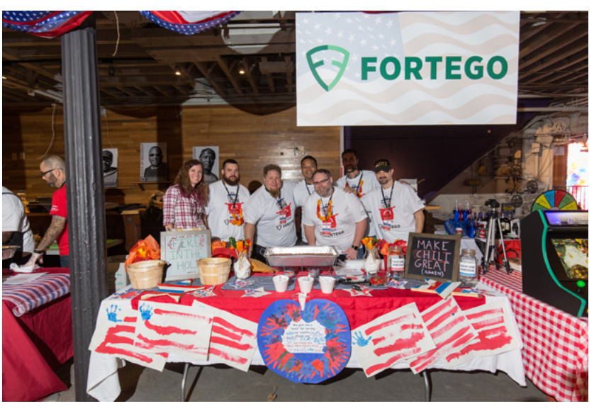
Members of the Fortego LLC team pose with their prize-winning entry as the "Judges Favorite" at the second annual Stars, Stripes & Chow event.