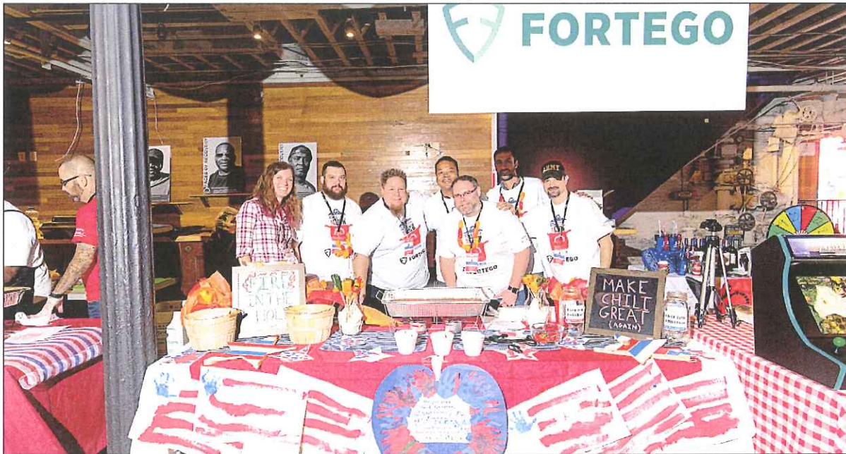
Members of the Fortego LLC team pose with their prize-winning entry as the "Judges Favorite" at the second annual Stars, Stripes & Chow event.